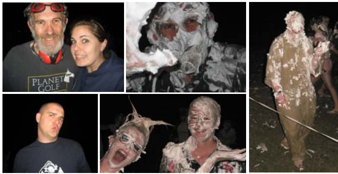
Before & after shots of the New Years Eve Party